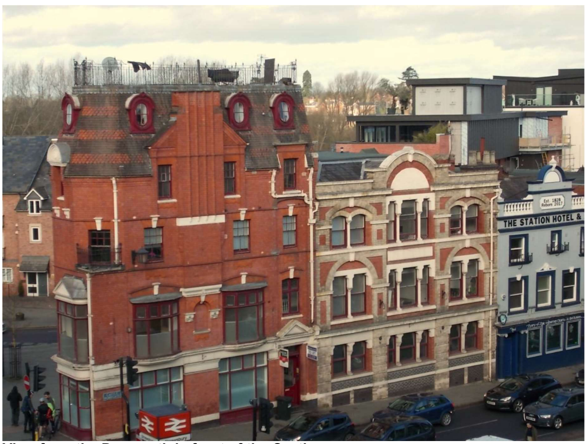
View from the Dana path in front of the Castle.