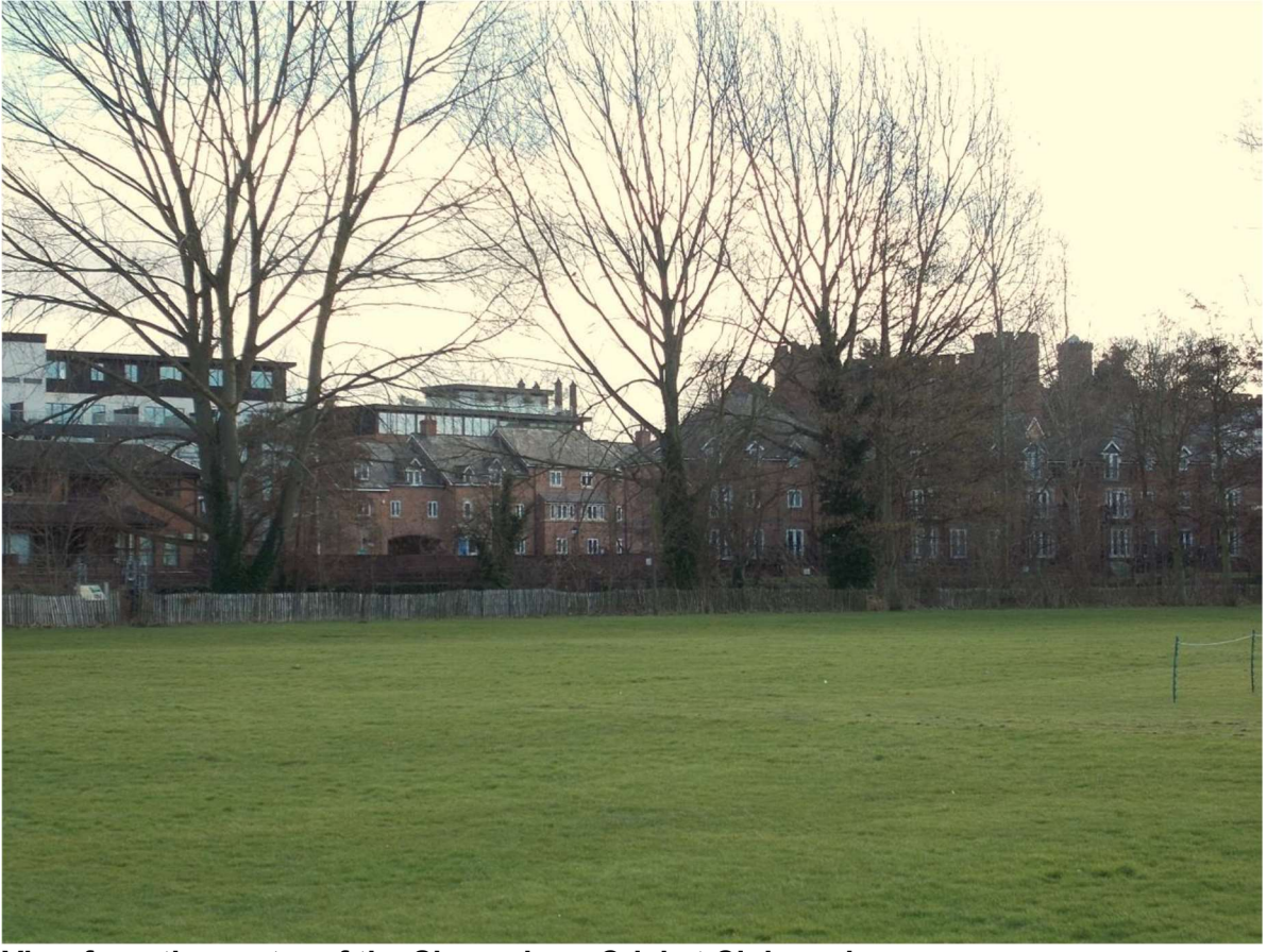
View from the centre of the Shrewsbury Cricket Club oval