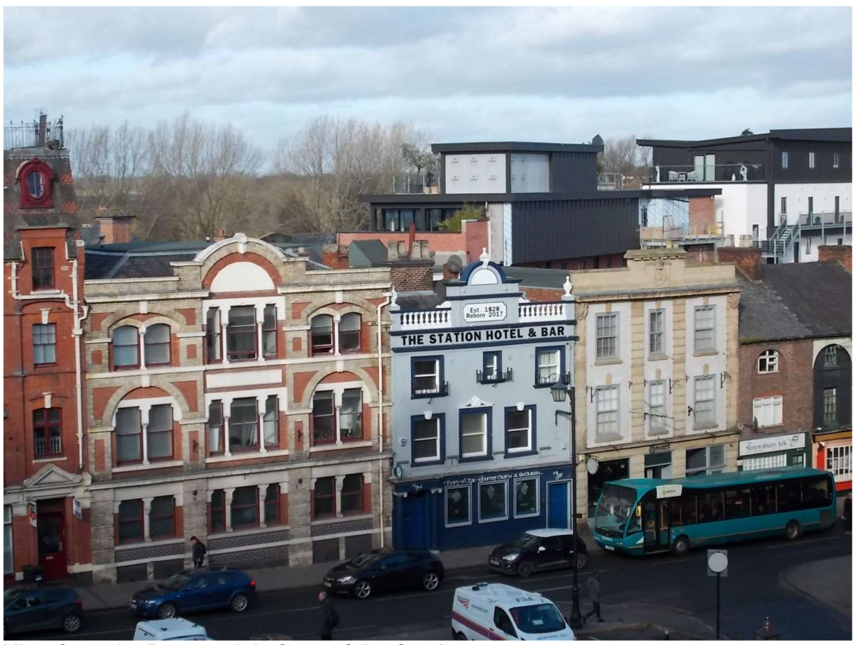
View from the Dana path in front of the Castle