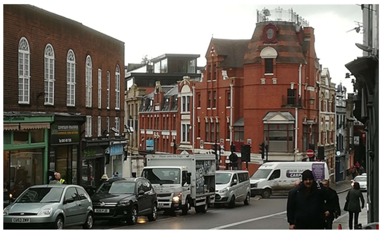
View from near the bottom of Castle Gates