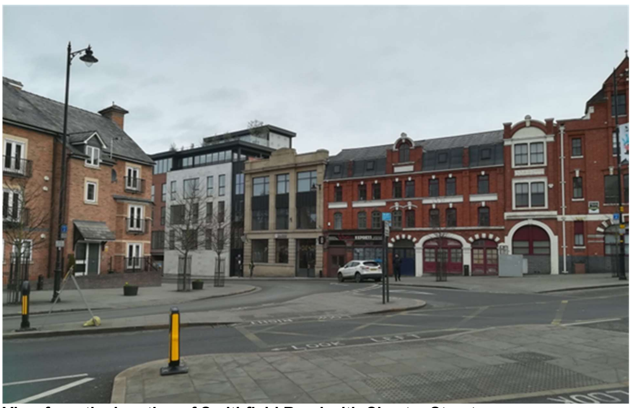
View from the junction of Smithfield Road with Chester Street