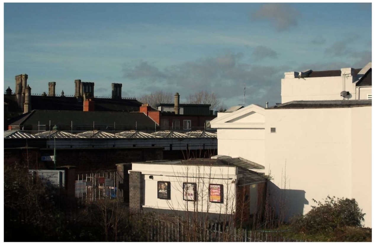
View from Beacalls Lane from just east of the Butter Market