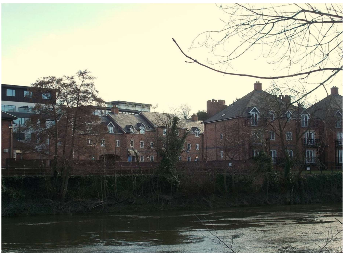
View from river side path to the east of the Shrewsbury Cricket Club oval