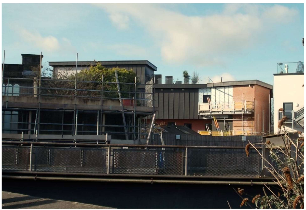
View from the North-West end of the railway station.