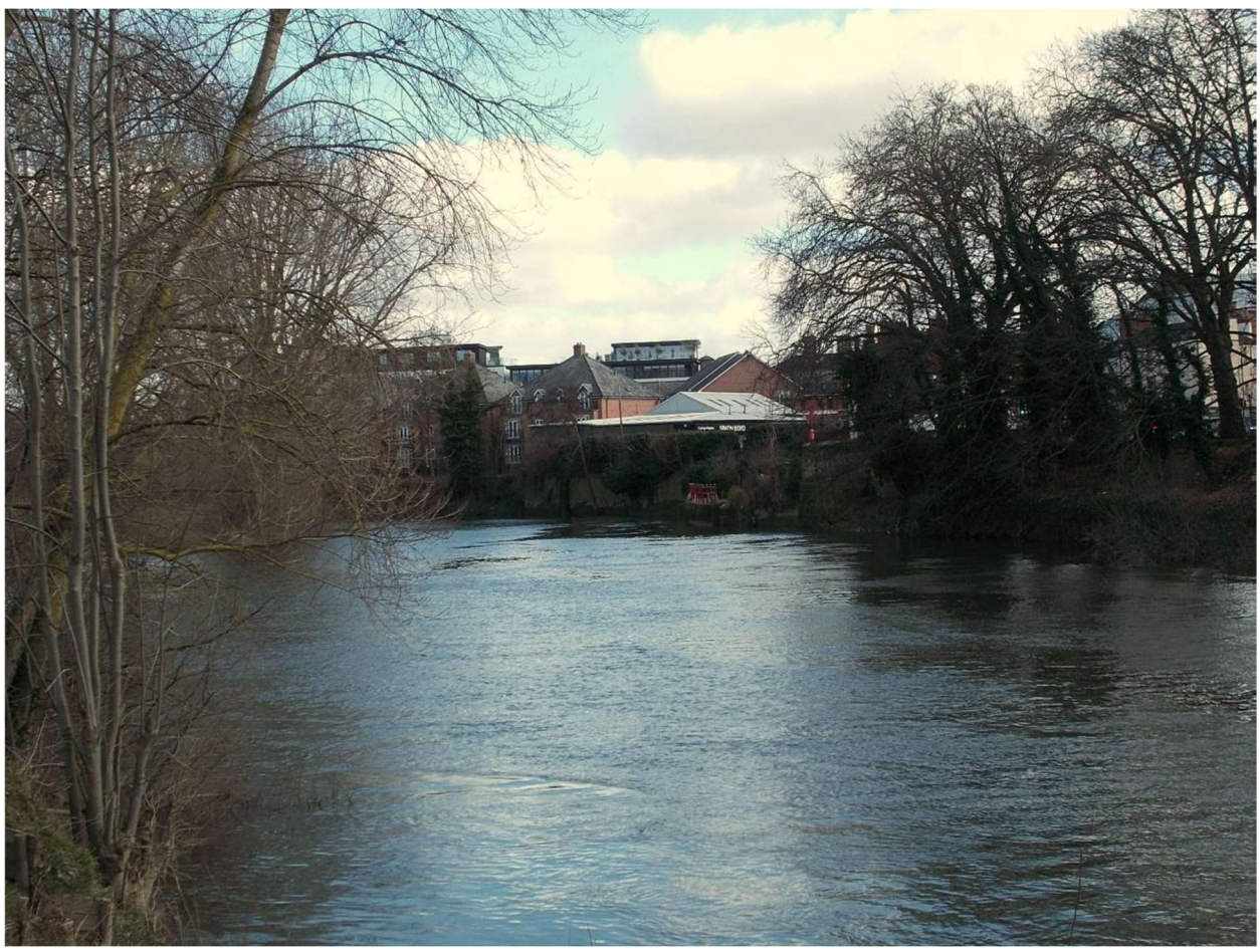
View from the river bank next to Frankwell car park and just east of the foot bridge.