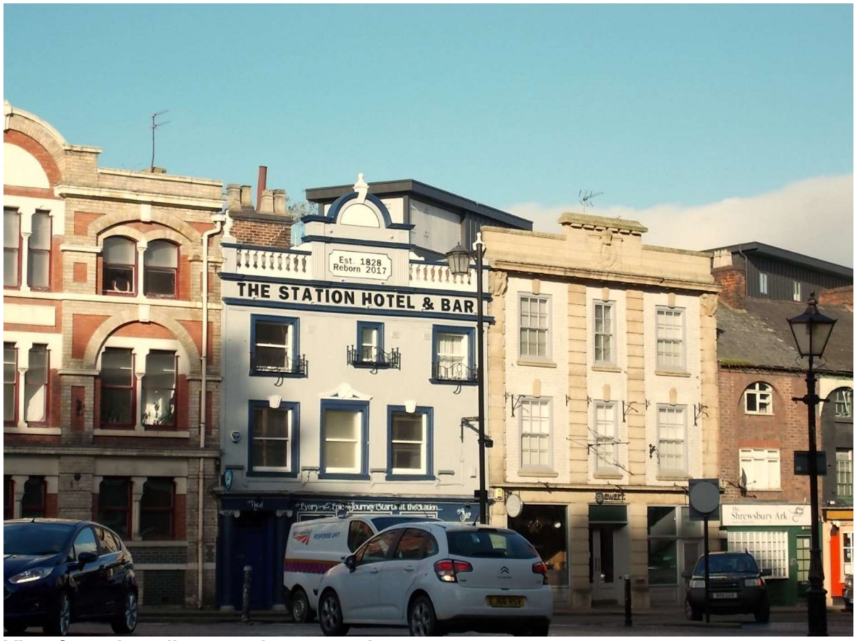
View from the railway station car park.