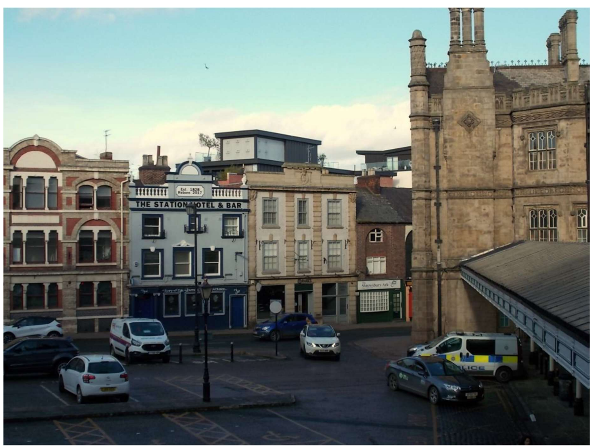
View from ramp to platform 1 at the bottom of the steps up to the Dana path.